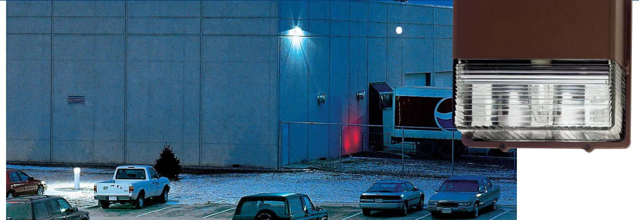
site, safety and security