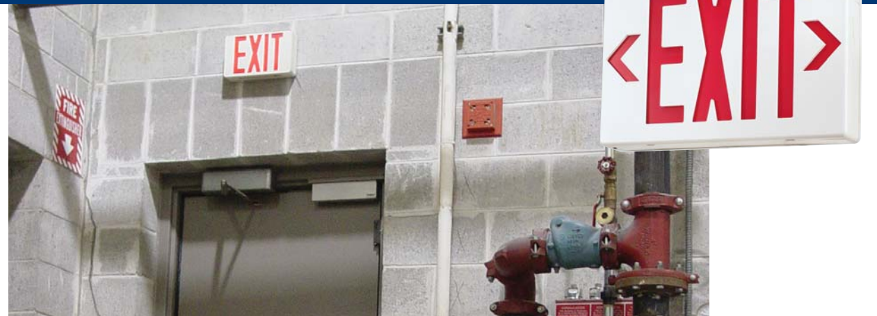
exit, egress and emergency